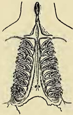
FIG. 3. PALATE OF DACTYLOMYS DACTYLINUS, No. 34594, NATURAL SIZE

Dactylomys dactylinus canescens , described by Thomas in the Annals and Magazine of Natural History for 1912, page 87, is of the dactylinus type with "rusty color of under fur strongly marked along the